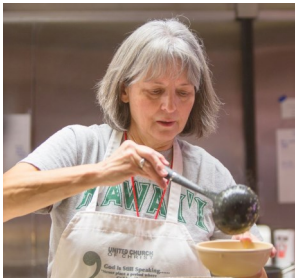
One of the volunteers

As wonderful as that was, the more significant experiences I have had this year were in a Lay Leader course I took called "Listening for God's Call in a Changing World." This course, along with several trips to the Arizona / Mexico border, have provided a great deal of reflection and contemplation.