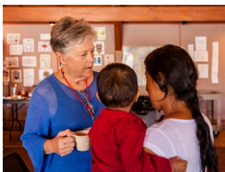
Getting to know the guests and hear their stories

By the time the next group of 40 arrived, the first group was much more comfortable and able to help the new guests feel at ease. What a gift to welcome the stranger, feed them, clothing them, and walking with them until we sent them on their journey to their sponsors.